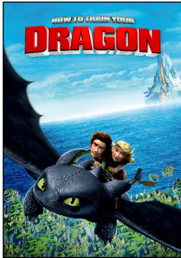
MOVIE OPTION 1

Last year we had more than 150 families attend!